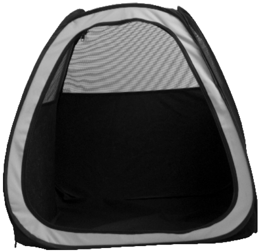
Auto Barrier Pet Pen