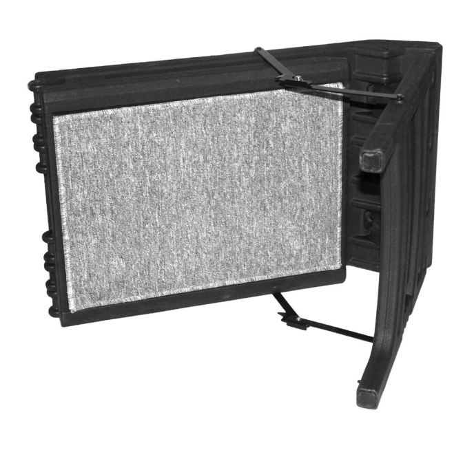
Step 2. Pull out the center support.