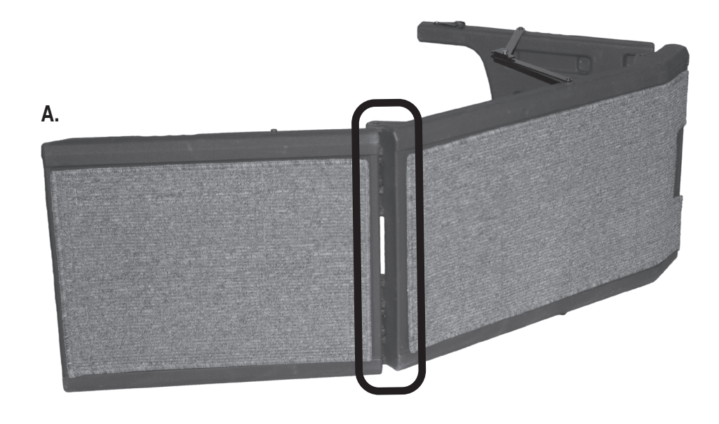
Step 3. Pull out the arm braces and lock into place.

Watch for pinch points while unfolding ramp (Figure A).